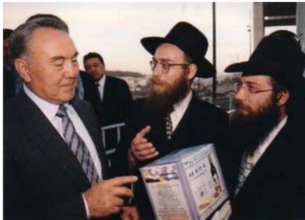
Kazakhstan - President Nursultan Nazarbayev